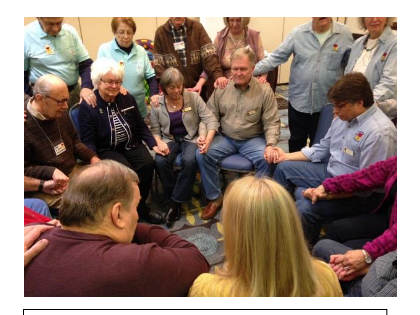
Commissioning of new leadership couples

On the following page is the reimbursement form for requesting funds from the North American Region funds.